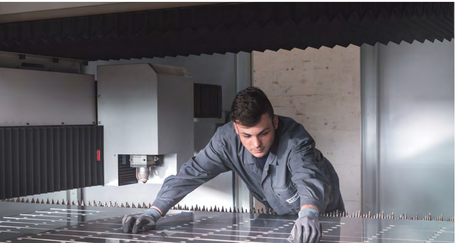
Side door for easy access