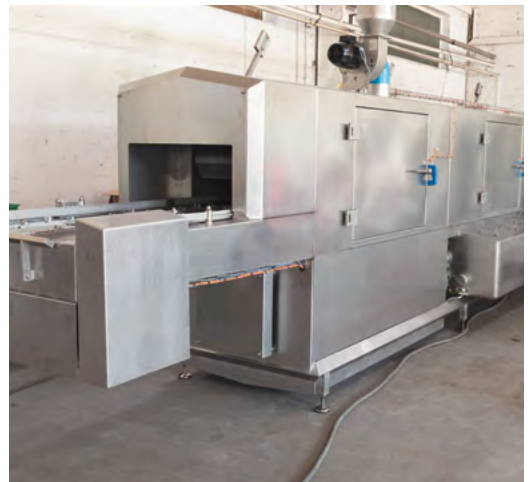
Continuous container washing system