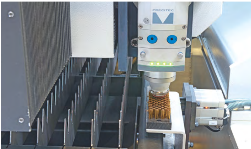
Precitec ProCutter Autofocus Cutter Head: • Automatic height sensing calibration after nozzle replacement • automatic nozzle cleaning