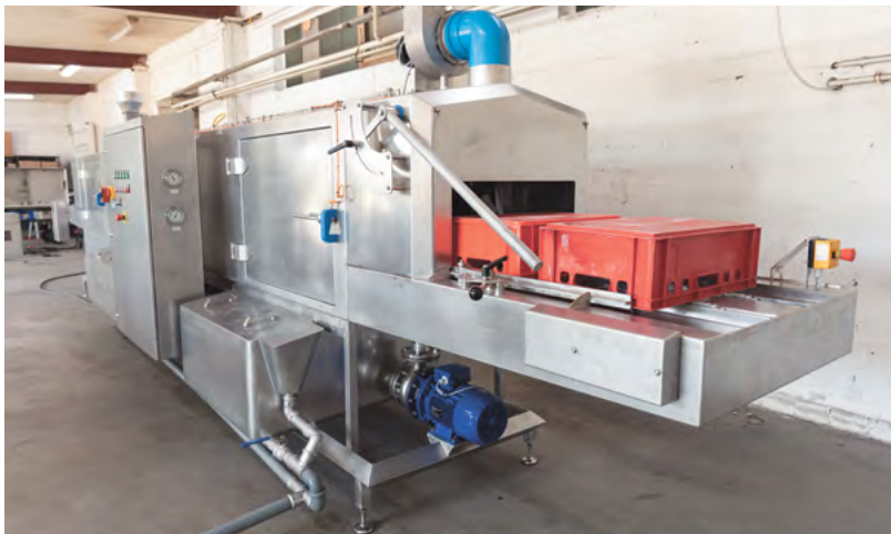
Continuous container washing system