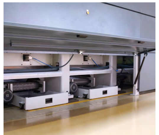
Hardware and slag conveyor