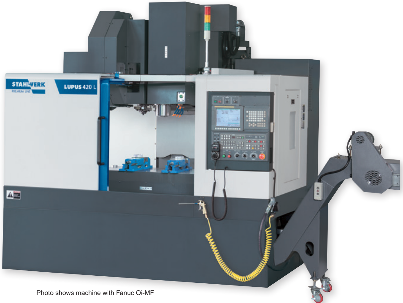
Photo shows machine with Fanuc Oi-MF